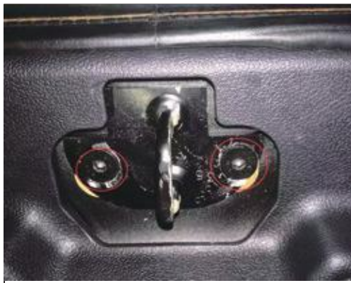
14. Remove the original car lock ring, install our specially designed lower lock ring, and fix it with screws.