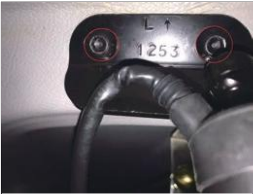
4. Remove the upper left ball head of the original car. Install our company's specially designed bracket and fixed with our screw.