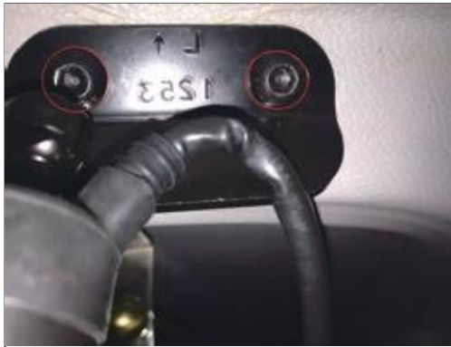
5. Remove the upper right ball head of the original car. Install our company's specially designed bracket and fixed with our screw (left and right alike).