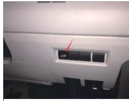
15. Install the tailgate switch under the main driving panel