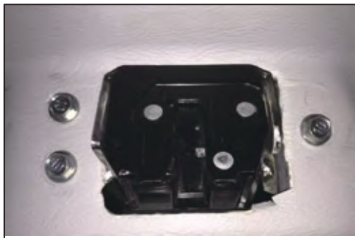
13. Remove the original vehicle lock, install our electric suction lock, and fix it with screws