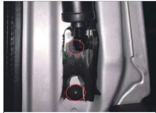
3. Remove the right lower bracket of the original car, install the bracket specially designed by our company, and fix it with screw.