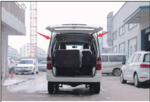
1. Remove the left and right support pole of the original car