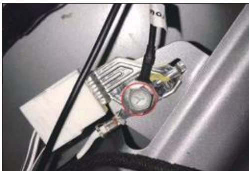
8. Connect ground wire at tailgate of original vehicle