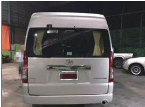
17. The tailgate installation is completed.

After the installation is completed, you must set up the tailgate programming settings.