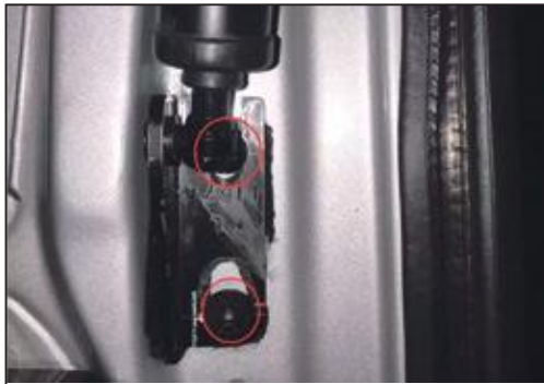
2. Remove the left lower bracket of the original car, install the bracket specially designed by our company, and fix it with screw.