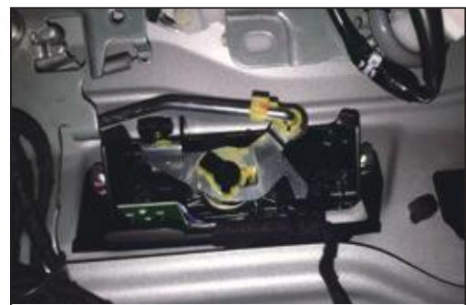
12. Remove the original vehicle mechanical lock, install our specially designed tailgate switch, fix it with the original vehicle screw