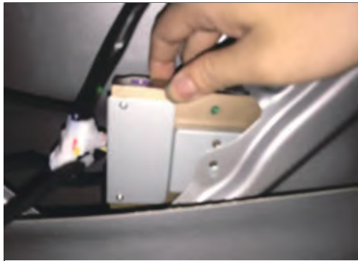
16. Control box installation location