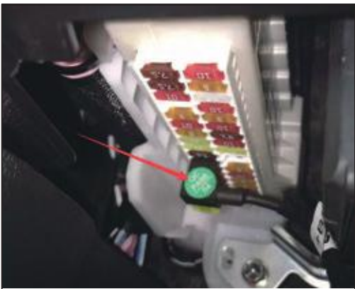
7. Electricity access from original vehicle driver's compartment