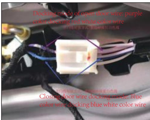
11. Opening door wire, locking door wire connection mode