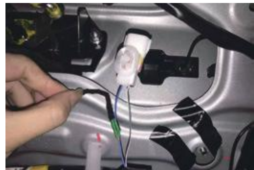
9. Inverted wire docking