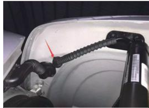
6. Waterproof glue is used to block up the threading of electric pole in original hole position.