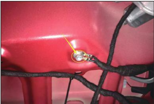
7.Grounding wire at rear