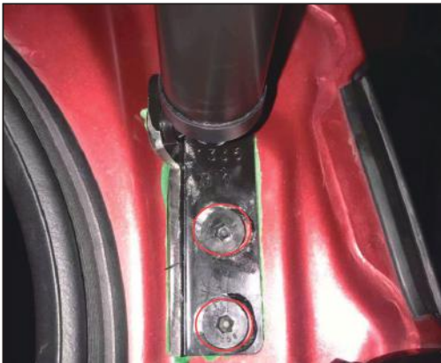
2.Remove the right lower bracket of the original car and install our special bracket Fixed with screw