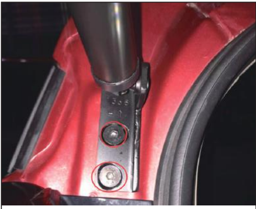
1.Remove the left lower bracket of the original car and install our special bracket Fixed with screw