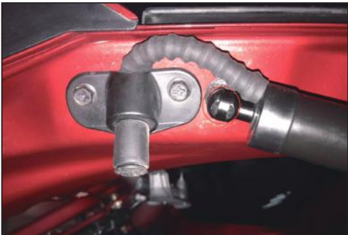
4.Remove the right upper ball head of the original car and install it. Our company specializes in ball head.