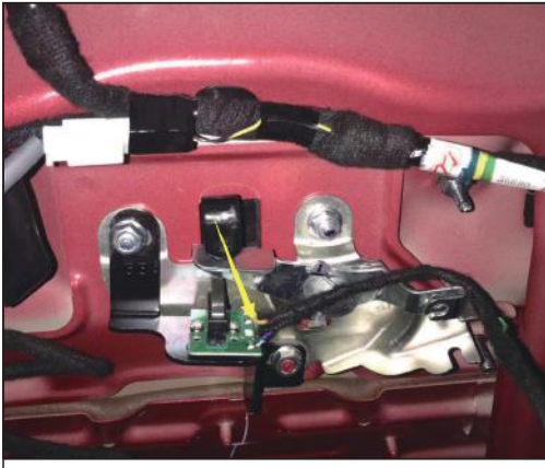
11.Install our rear door handle switch on the original car