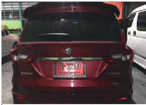
14. Installation Completion Reduction Vehicle

After the installation is completed, you must set up the tailgate programming settings. Make sure that the doors are closed in place.