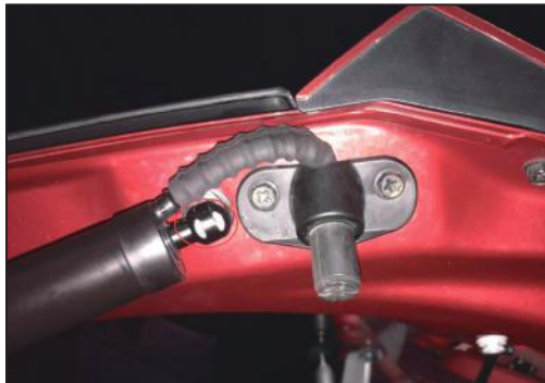
3.Remove the left upper ball head of the original car and install it. Our company specializes in ball head.