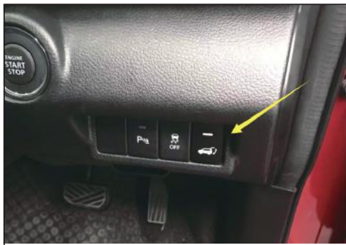
13. When the original owner drives down the original car key, install the tail door switch