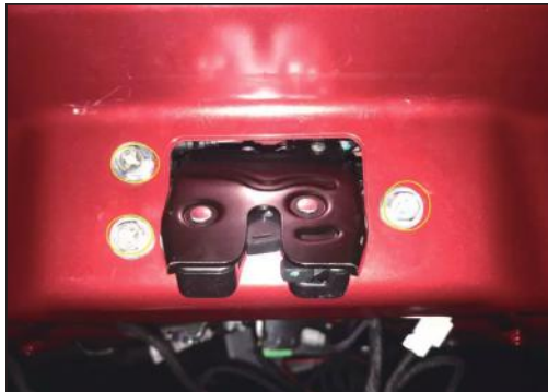
9.Remove the original locks and install the electric suction locks of our company Screw Fixation