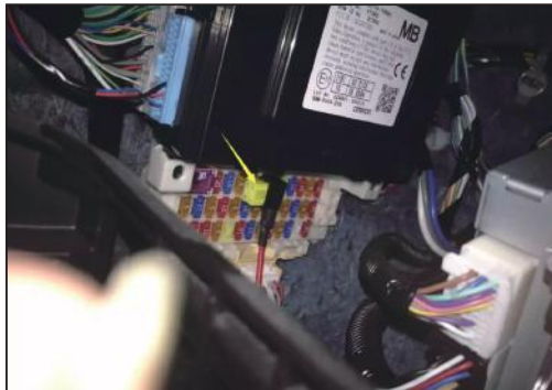
6.Driver's power supply