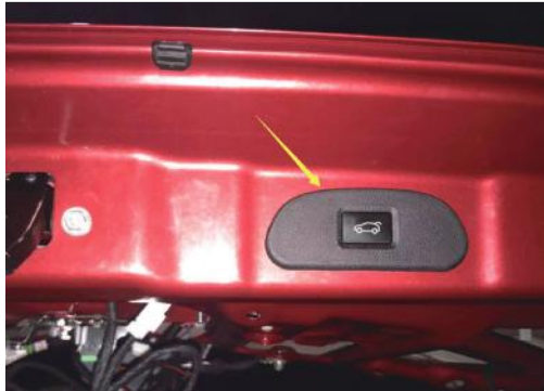
12.Punch holes in the rear of the original car to install the tail door switch