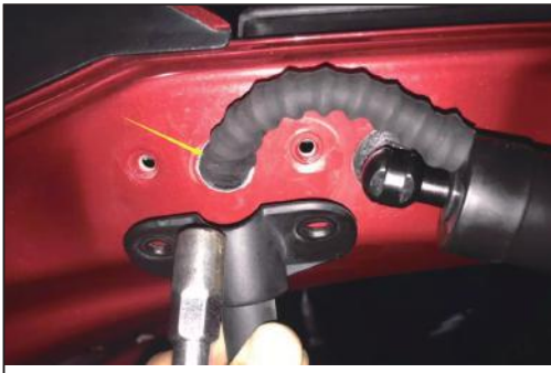
5.Remove and install the screw shown above and below the original car.Pole alignment