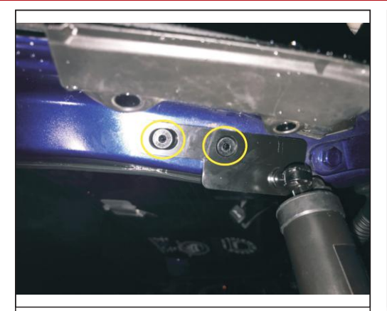
1. Remove the original car right bracket and brace, installing stents and brace, use our screws