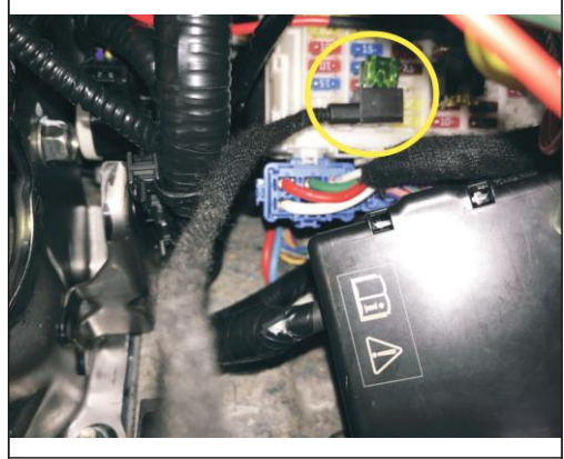
8. Below the main driving remove the plaque, find the original vehicle power supply, fuse, unplug the original car plug in power socket