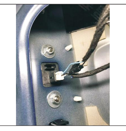
13.Before switching line lines to connect this seat white and black