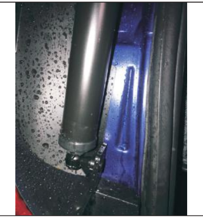
4. Remove the original car bottom bracket, installation, bottom bracket, with screws