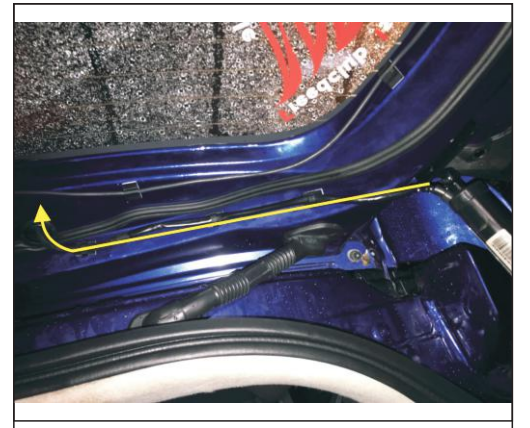
7. We delay the yellow line through the rubber plug hole hall, go line to stern door cover plate (or steps)