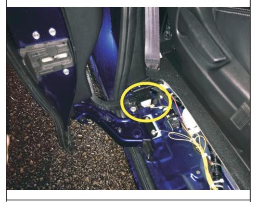
10. In the main drive belt B column below remove the plaque to find the original car Central Line