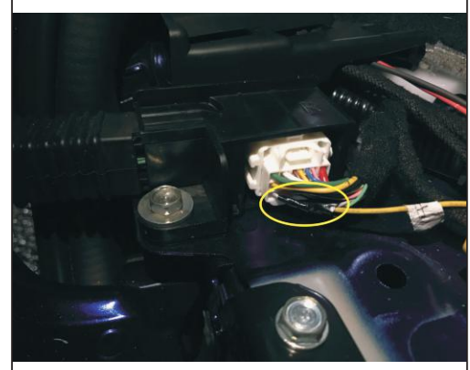
11.Our yellow Central Line meet the saddle gray line