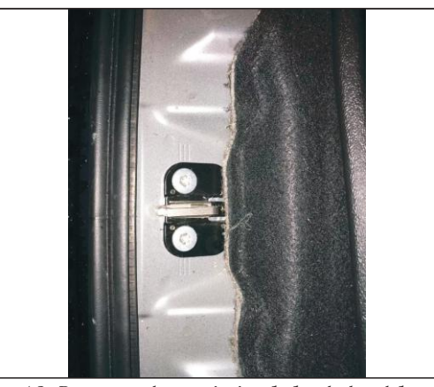
12. Remove the original lock buckle, install our electric lock, in the original car screws