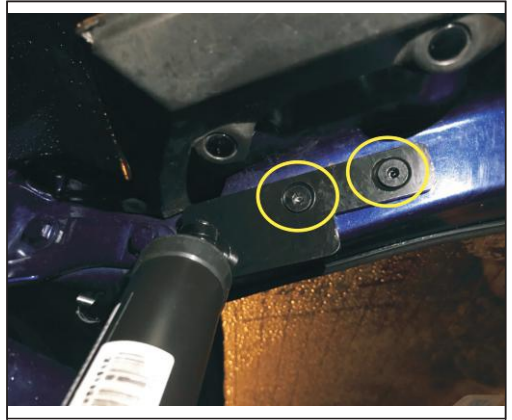
3. Remove the original car left bracket and brace, installation of upper bracket and brace, use our screws