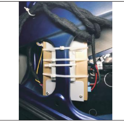
16. Installation position and control box, with our cable tie