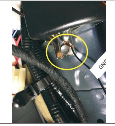
9. Found at the bottom of the main driving ground screw, connecting our earth